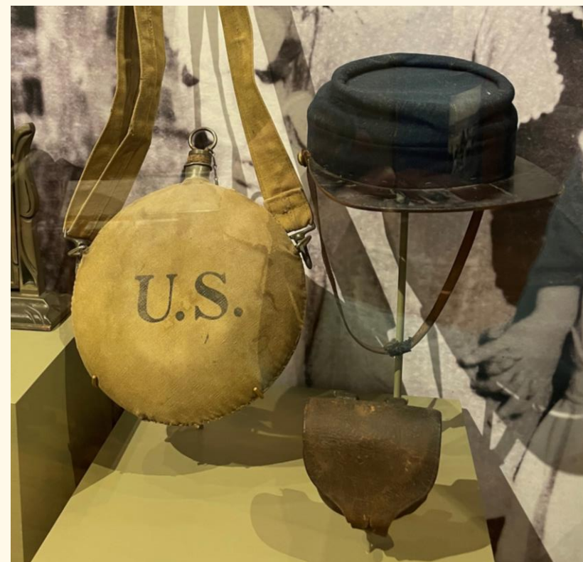
Joseph Goodman's Civil War items. Canteen, uniform cap, and rifle cap box on display at Harbor History Museum. 1860s.

Object ID: 1973.010.012 Harbor History Museum Collection