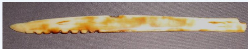
Small harpoon. Bone.