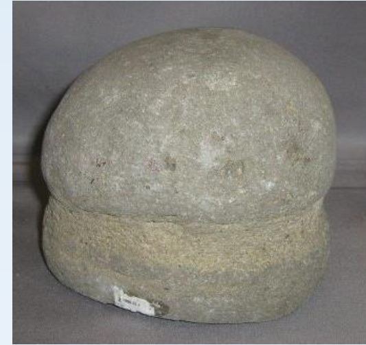
Canoe anchor. Stone.