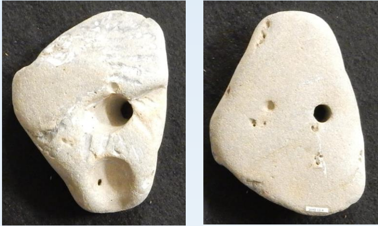
Net Weight. Stone.