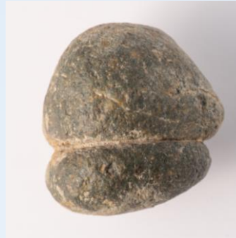
Net weight. Stone.